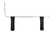
Wire Rack Handle